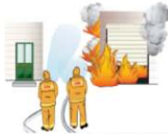
Figure 30 – use of water to protect exposures from radiant heat

To try and minimise the threat of radiant heat, close doors and use water curtains or protective sprays to cool down the exterior of nearby structures.